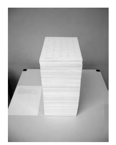
Manfred Werder was born in 1965. He lives in Zürich.

He performs with such groups as plus-minus (London/Brussels), Ensemble Expos'e (London), ELISION Ensemble (Brisbane), Ensemble Modern (Frankfurt), 175 East (Auckland), musikFabrik (K"oln), WDR Rundfunkchor K"oln, Ensemble Offspring (Sydney) and Ensemble Laboratorium (Europe).